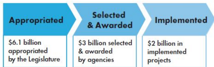
Summary of GGRF Funding Status as of November 30, 2017

region, district, or county, the same project data is included in each area that benefits from the investment. This method of attribution tends to increase the implemented project totals reported here. Implemented High-Speed Rail Project funds ($547M) have been omitted, which decreases implemented project totals in this document. As a result, the “Total Funding Implemented” summations in this document differ from the individual project funding summation values in the Annual Report. See the GGRF Project List for a more detailed explanation of the methodology CARB used to evaluate projects that cross geographic boundaries.